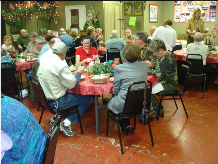
LFSA Members Enjoying Dinner